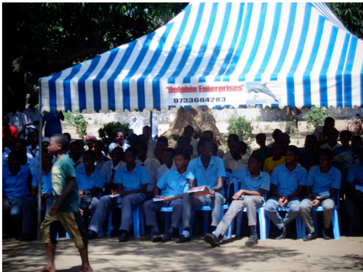
In-school boys at the BRAVE messengers' retreat in Malindi

The retreat therefore was held as part of an effort to build resilience among the youth against violent extremism.