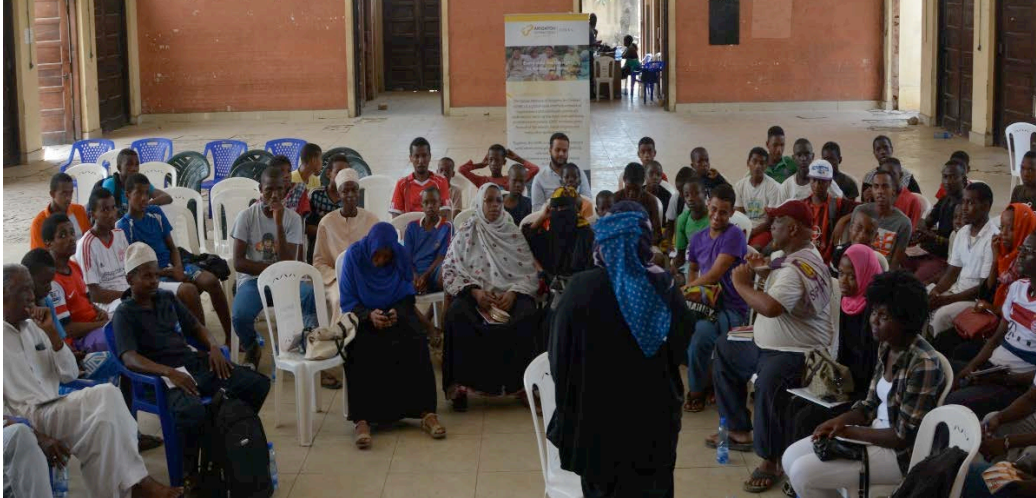
Participants during a focus discussion group session during the workshop

Throughout the reporting period, consultations and community engagement on strategies to address VE continued in North Eastern, Coast and Eastern regions of Kenya