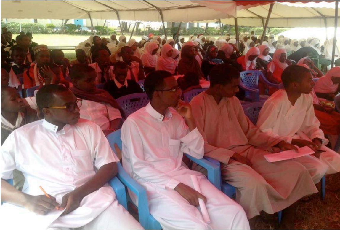
A section of the youth during the BRAVE Messengers' Conference

In her remarks, Hon. Farida Salim said that no religion supports nor promotes violent extremism and cautioned the youth against joining extremist groups. She said that, Islam exhorts its adherents to be good to mankind and perform good deeds and that killing innocent people is abhorred and prohibited in the holy Qur'an (5:35). She also quoted from the teachings of Prophet Muhammad (Peace Be Upon Him), "The Muslim is the one from whose tongue and hand the people are safe, and the believer is the one who is trusted with the lives and wealth of the people." She urged the youth to concentrate in their studies so that they become fruitful future members of their communities.