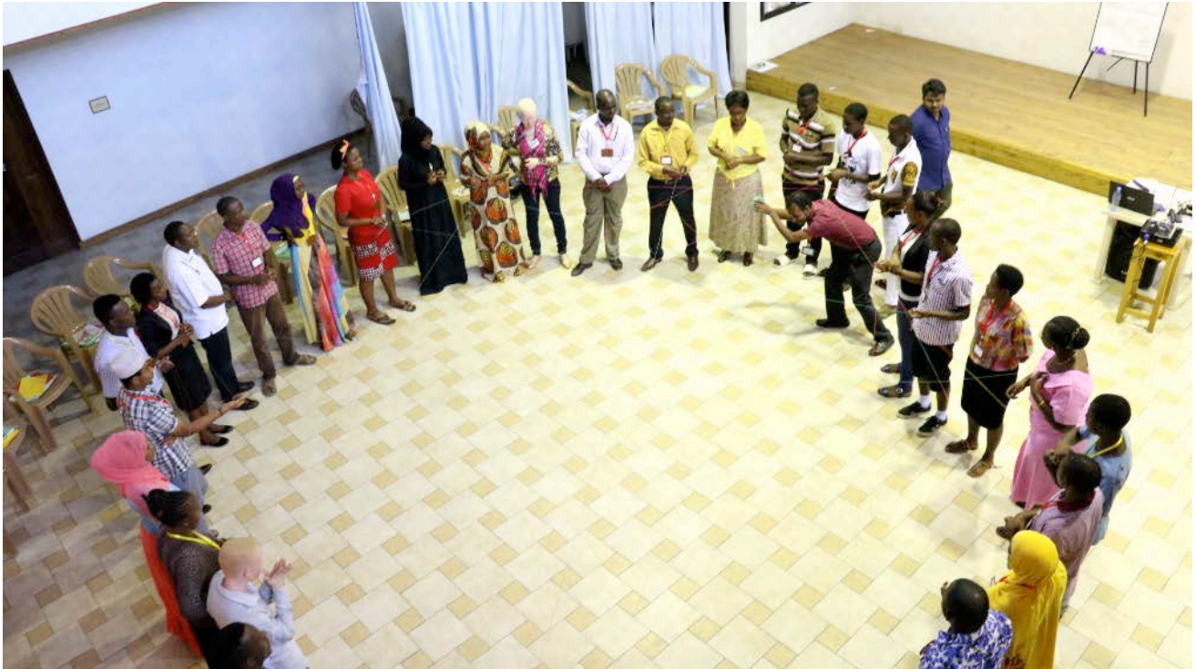
LTLT participants in one of the training activities